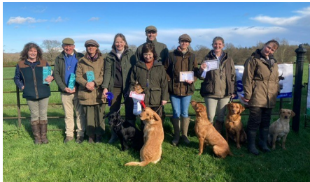
ND-NH award winners and judges

Surprise doesn’t describe it when I heard them saying our names as the winner of the NDNH test! Two things I learned that day - don’t be afraid to use your stop whistle and learn to read your dog,”