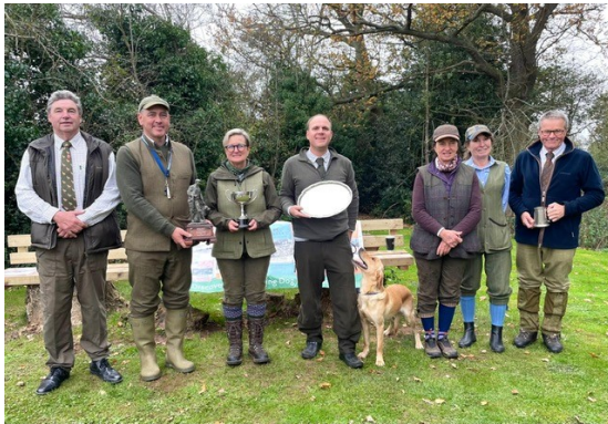
The judges and award winners