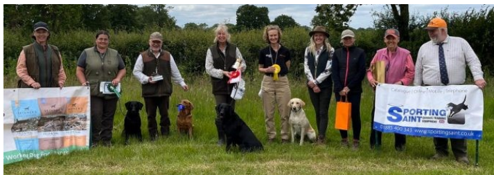
Novice award winners and judges

Thank you to everyone involved in planning, setting up and organising the tests, making good use of the open ground, hedges, woodland, crops, long grass, distractions and jumps to give the dogs different challenges. Great stewarding to keep the tests running quickly and efficiently and lovely, encouraging judges. Murphy did really well and I was thrilled to win."