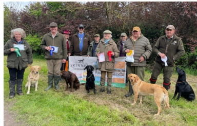
Intermediate award winners and judges

When Athene did not get a CoM, I was a little disappointed as I felt she had risen to the occasion. So I was utterly shocked and delighted when it turned out she had won the Intermediate. A big thank you to the owners of this beautiful estate and to the judges, helpers and organisers who make it all possible. How grateful I am to have discovered in retirement such a friendly community - it was lovely to see old friends again and to meet some delightful new ones.”