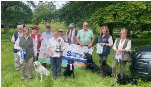
Open award winners and judges