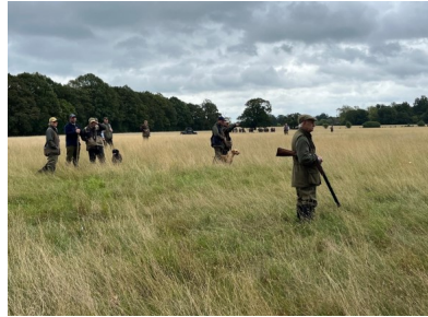
A stormy-looking but dry day!