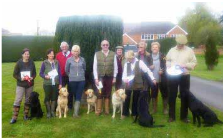
Prize winners and judges.