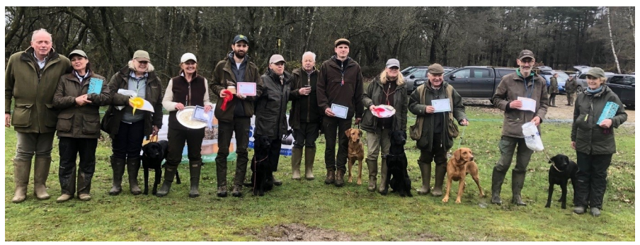
The award winners and judges

The judges were fabulous and there's no doubt the helpers and the test organiser were the stars of the day. Thank you to all involved for a well organised and enjoyable event. It was a very special day for us.