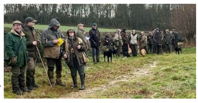
The gallery at Bereleigh

Our helpers, many of whom are on the GWGC committee, turned out again, providing a tried and tested team. Finally, thanks to our sponsors, Skinners Dog Food and Silent Pool Gin.