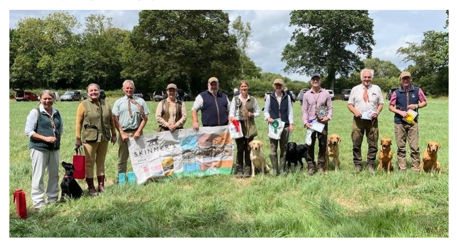
Award winners and judges

There were five challenging tests, including extremely long marks and blinds with distractions, tricky angles in woodland and a walk up with two retrieves each.