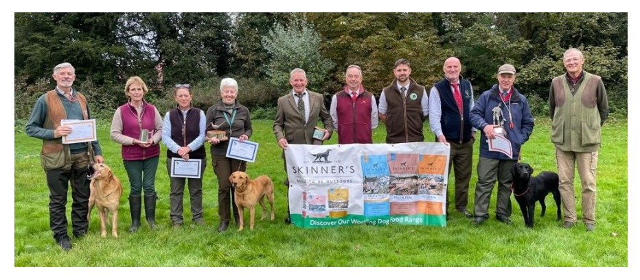
Trial 1: 24 Dog 2-Day Open AV Retriever Stake, Ampton, Monday 30<sup>th</sup> and Tuesday 31<sup>st</sup> October 2023