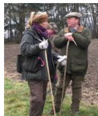
Pause for thought

The third round with eight dogs remaining was walked up in woodland. Judges, competitors, and dogs had to contend with fallen trees and thick bramble which proved to hold plentiful birds. The retrieves included pricked birds dropping at