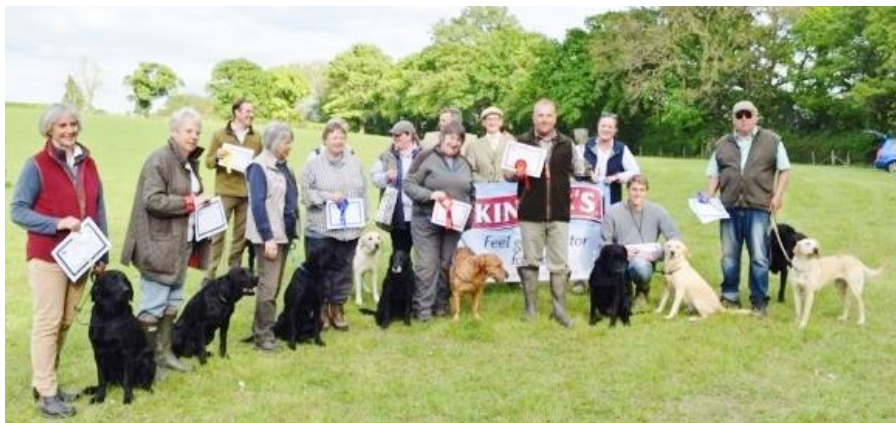
Three tests in one day. All the award winners get together for a group shot.