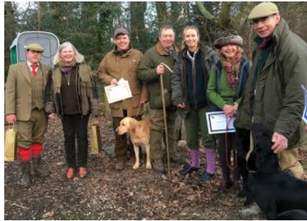
Judges and award winners.