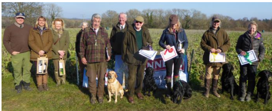
Award winners and judges.