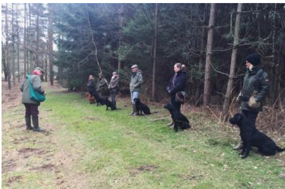
A training class at Hampton last year

We would very much appreciate your comments on the timing and content of training. You can email me or jot down your suggestions and hand them to me at class, anonymously if you wish.