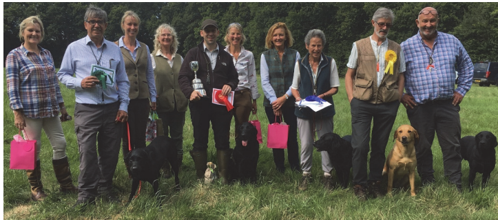
Left: Award winners and judges at the Open Test.