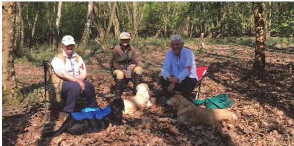
Competitors with veteran dogs chase the shade at the 2019 test while they wait their turn.

Closing date for entries: Friday 8 th May 2020. No refunds after closing date.