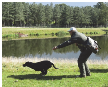
Right: The water at Cuffley circa 2017