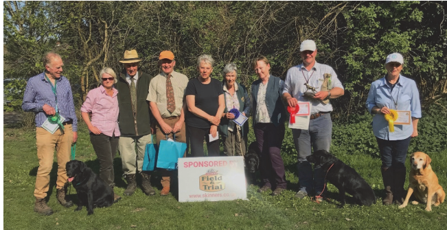
Veteran award winners and judges.

Test 3: a double mark with the first mark into rushes and the second out on the grass. Test 4: a very long mark down a track into a tunnel of trees, with a blind to be picked further back. Test 5: a two-dog walk-up with a long and a short retrieve in line with each other. The scores were close at the end, so we had a run off with two retrieves.