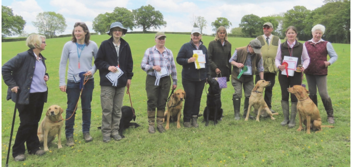
Award winners and judges line up together.

with both landing out of sight at the bottom of a hill.