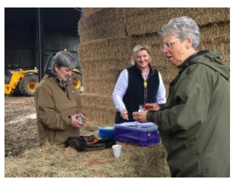
The pictures on these two pages were taken at the first Club training of 2017

Once again, landowners have a very important message for us: it is ESSENTIAL that all dog waste is picked up, bagged and taken home.