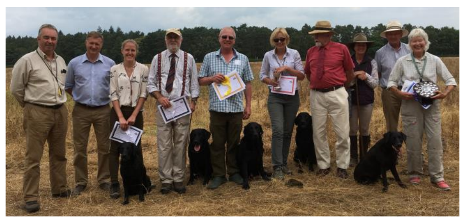
Proud award winners and their judges in the scotching hot walk-up field

I was thrilled to win. A wonderful day, thank you to Guildford Working Gundog Club.