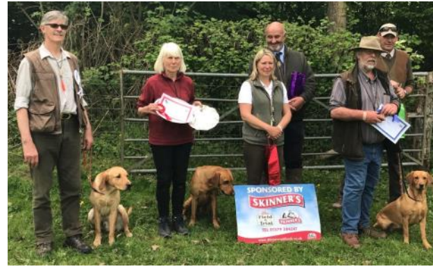
The award winners with their puppies and the judges

There were four tests, the first was a mark over water and then a blind slightly to the right, tricky, owing to the wind but we did it. Next came a mark then a blind to a post. Much hunting for the mark but not a fault on the blind. The third test was a double mark and the last a walk up.