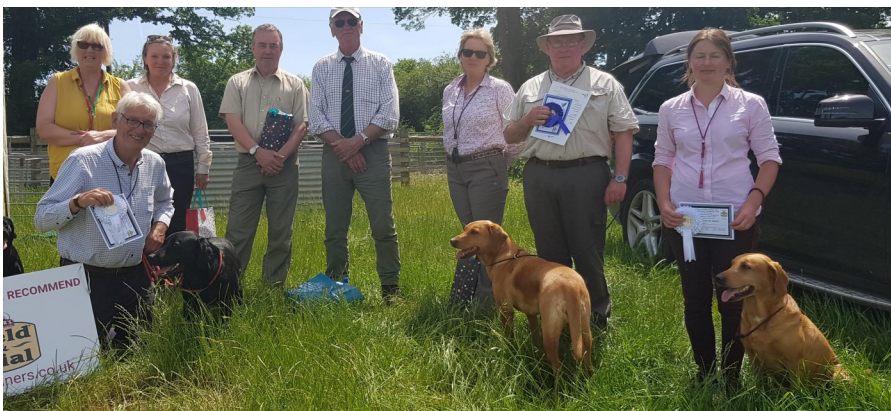
Winners and judges for the Intermediate Working Test on Field Trial Lines in 2019