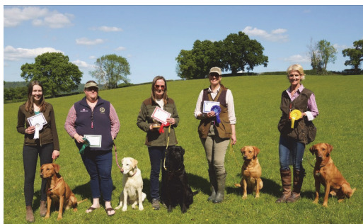
Novice Dog-Novice Handler award winners

The day started well (not) with me arriving late even though I was 10 minutes down the road. The weather was perfect: bright and sunny with a light breeze.