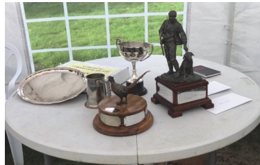
Right: The Open trophies