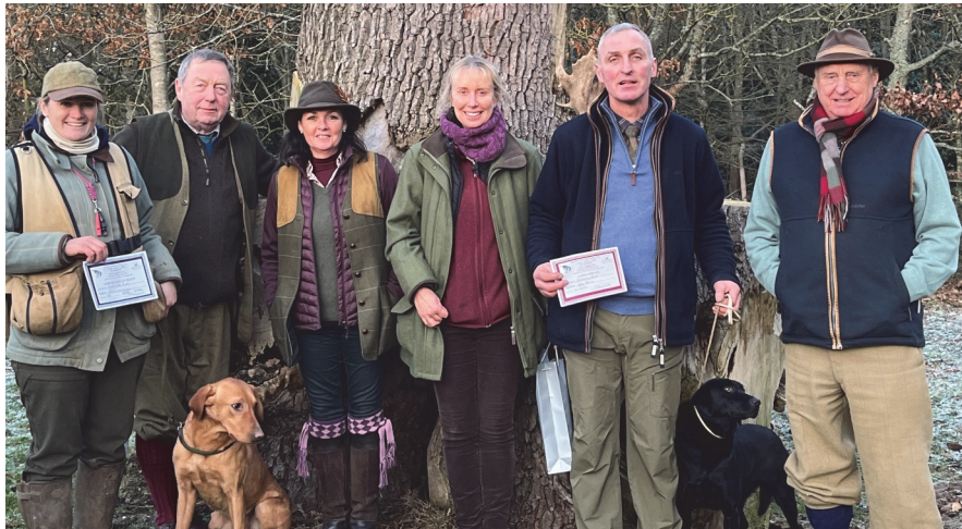
Award winners and judges