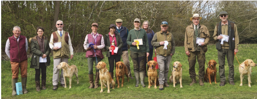
Award winners : a first, a second and four COMs with just two points between them pictured with their judges.

tight angle. A tricky one, and a great test of marking and lining up tightly at an angle. Flo had a lovely run and we were later told she was the only dog to score 20. The second test was a two-dog walk up in long reeds and marshy cover with two marks for each dog. Flo did a lovely job and we came away with 20.